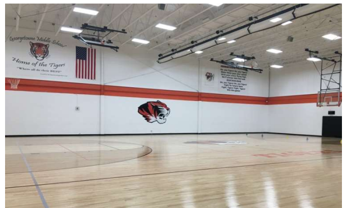
PURR-FECT UPDATES. The newly updated GMS gymnasium is up and running just in time for the winter sports season!

These projects were completed because the gym was rundown and the roof was allowing water to leak in the building.