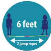
Keep 6 feet of space between you and your friends