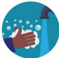
Wash your hands often

Stop the spread of germs that can make you and others sick!