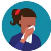
Cover your coughs and sneezes